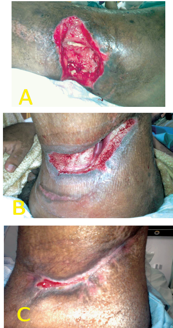
Fig. (3): (A) Post traumatic wound in the middle of the posterolateral aspect of the left thigh with measuring approximately 17 X 9cm. (B) After 4 cycles of NPWT, the wound is about 10 X 4cm. (C) After another 5 cycles the wound is almost a 9-cm long linear.

Use of NPWT has changed the merits of the classic reconstructive ladder [15]. Immediate use of NPWT can significantly reduce hospital stay [16] and subsequently nosocomial infections and depressive psychological impact of that vicious cycle of being ill. The conventional wound dressings adhere to dead tissue. When the gauze is removed, it also removes viable and nonviable tissue and may damage the granulation tissue with its new epithelial cells [17]. Our concept of early use of NPWT in acute limbs trauma is to shorten duration of treatment which is the main advantage of it. This will allow early ambulation and early